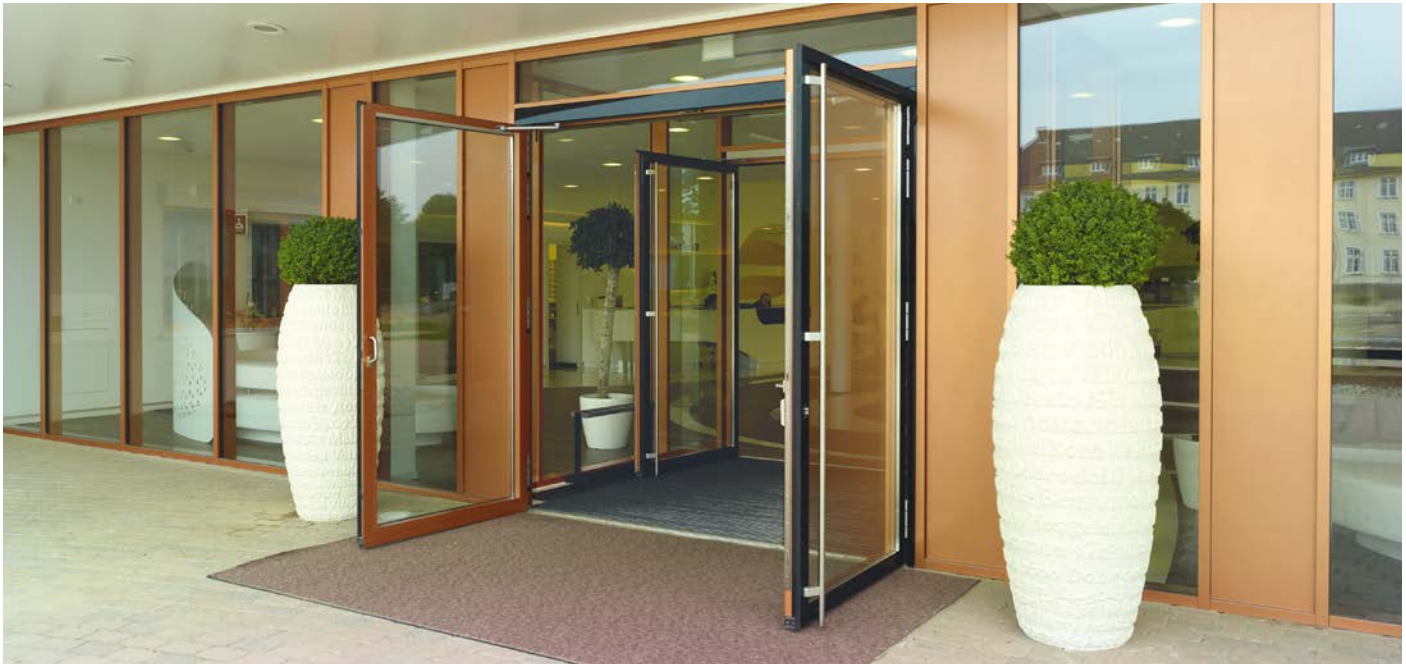
ED100 low energy operator

dormakaba defines security, sustainability and reliability. For more than 150 years, our brands have been associated with trust earned through superior performance and living up to our mission—to make access in life smart and secure. Holding true to this promise and to our values will help us achieve our ambition to be the trusted industry leader.