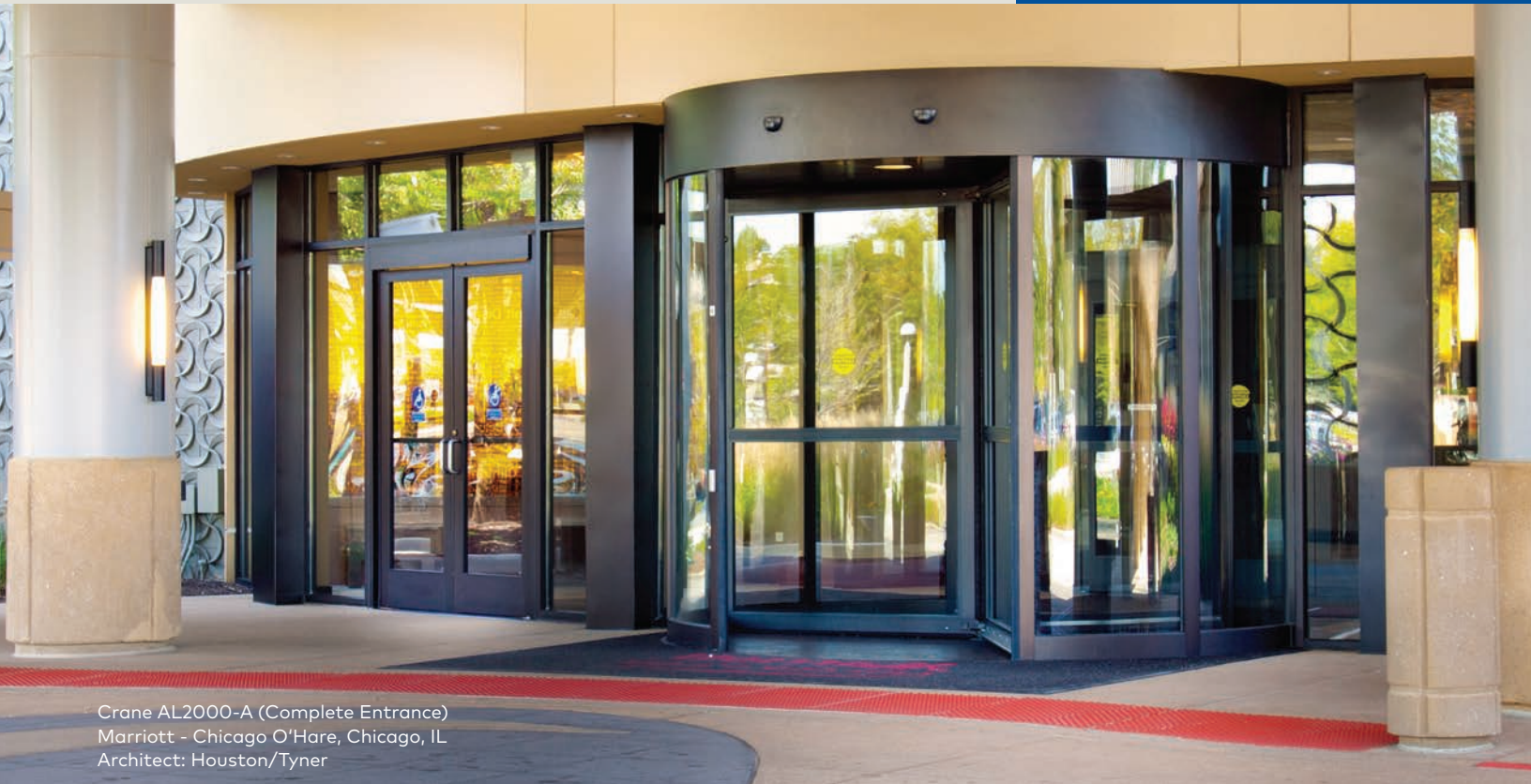
Crane AL2000-A (Complete Entrance) Marriott - Chicago O'Hare, Chicago, IL Architect: Houston/Tyner

The 2000-A Series features the torque-driven Crane Modular Drive System. The reliable advanced microprocessor control monitors the door and occupants to ensure safe operation.