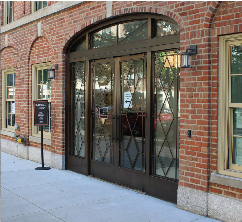
40 East 72nd Street, Manhattan, NY, United States