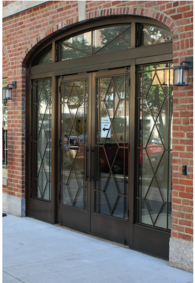
40 East 72nd Street, Manhattan, NY, United States

Laser cut from single sheets of material, our Standard Series doors create a truly seamless door face with no face welding. Brake formed glass stops are applied at both the interior and exterior of the door with no exposed fasteners, a feature only available at Dawson. Every Standard Series door is available with an array of options including crossrails, muntins, grilles, as well as custom shaped glazing stops. The all industry standard hardware can be incorporated to these doors due to the versatile design and custom engineering available by Dawson. All Standard Series doors and frames are available in painted finishes as well as most industry standard finishes.