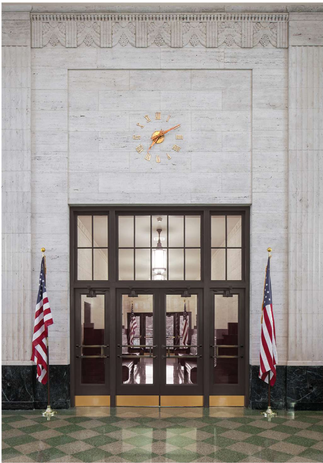
Erie - Lackawanna Train Station, United States