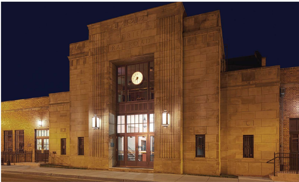
Erie - Lackawanna Train Station, United States

Installation-Repair-Service Specializing from the Conceptual Design 1-800-371-2208