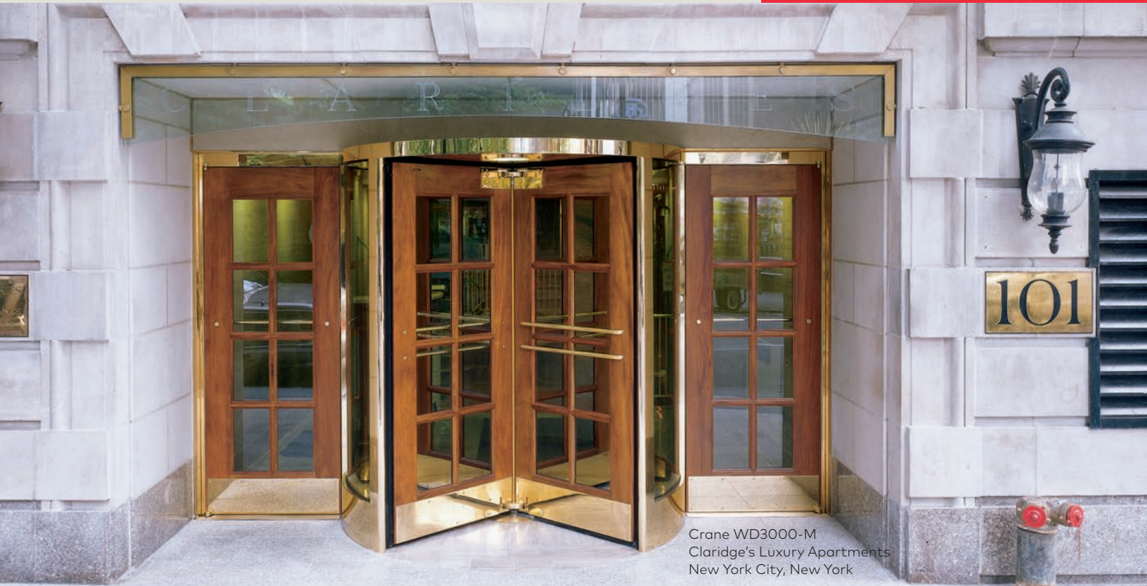
Crane WD3000-M Claridge's Luxury Apartments New York City, New York